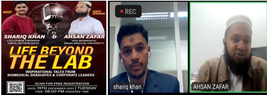
Figure3: Event highlights and student participation

An online seminar titled “Life Beyond the Lab” was conducted by IBET alumni under the supervision of the Deputy Director Student Affairs. The session highlighted the professional journeys of biomedical graduates and corporate leaders, motivating students to explore diverse career opportunities beyond academia.