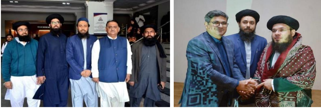
Figure7: Event highlights and student participation

Students of IBET, LUMHS organized the Seerat-ul-Nabwi (ﷺ) event under the supervision of the Head of Department (HOD). The event aimed to promote awareness and understanding of the life and teachings of the Holy Prophet (ﷺ).