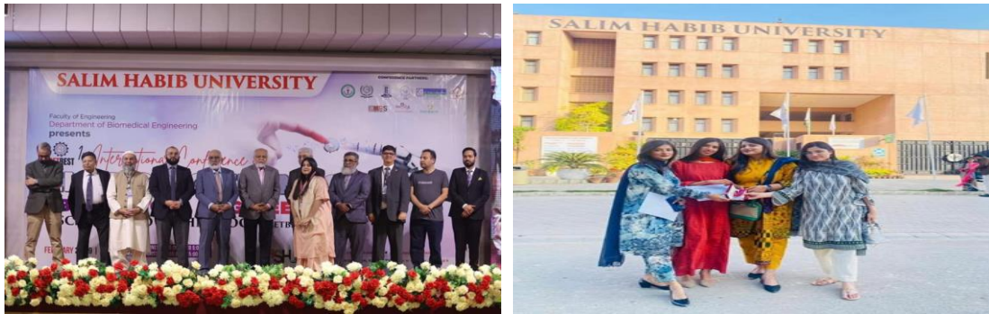
Figure5: Event highlights and student participation

Students of Batch 20, IBET, participated in the conference held at Salim Habib University, Karachi. Under the supervision of the Deputy Director Student Affairs, students achieved Silver and Bronze medals, demonstrating their academic excellence and research capabilities.