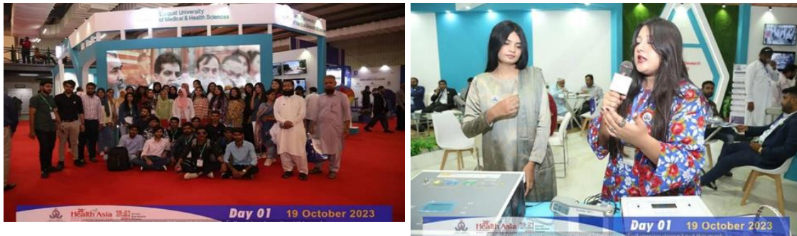
Figure1: Event highlights and student participation

Students from IBET proudly represented LUMHS at Health Asia 2023, where they presented their simulators and other innovative biomedical projects under the supervision of the Deputy Director Student Affairs. The event provided a valuable platform for students to showcase their technical skills, creativity, and practical knowledge while interacting with professionals from the healthcare and engineering sectors.