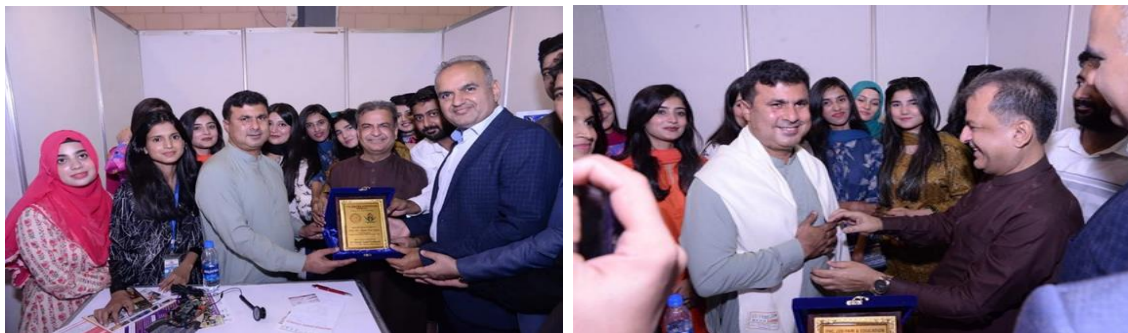
Figure6: Event highlights and student participation

Students of IBET, LUMHS participated in the PHC Expo & Job Fair 2024 at Expo Centre, Karachi under the supervision of the Deputy Director Student Affairs. The event provided networking opportunities and industry exposure.