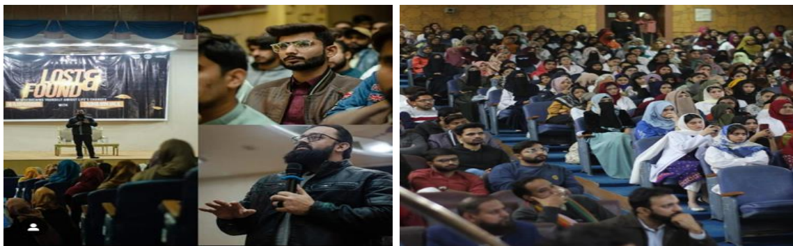
Figure2: Event highlights and student participation

BESAL IBET organized the “Lost & Found” Youth Club event under the supervision of the Deputy Director Student Affairs. The event focused on encouraging students to rediscover themselves during life’s transitions, promoting self-awareness, personal growth, and emotional well-being among participants.